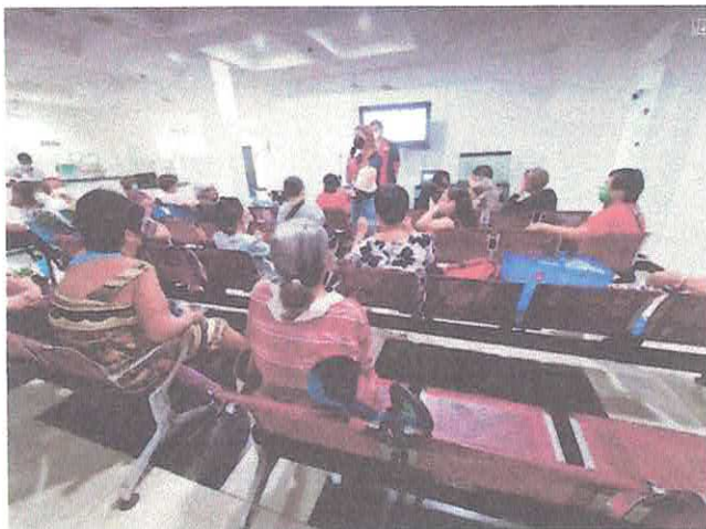
”Pen Pen De Sarapen SENIOR ko Malakas parin!” – August 8, 2022