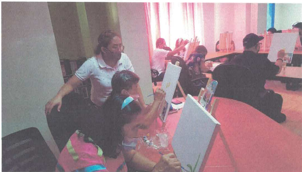
Art Therapy Session